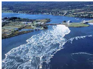
Fig 1: La Rance tidal barrage, France (240 MW) Fig 2: Annapolis Royal tidal barrage, Canada (20 MW)

Tidal energy is becoming an increasingly viable option within the field of renewable energy due to its reliability, predictability and the size of the resource. Government commitments to reducing carbon emissions, increasing energy demand and an uncertain security of supply of more traditional energy sources ensure that tidal energy is viewed as a feasible alternative.