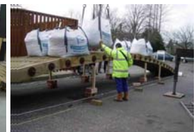
15m span bridge