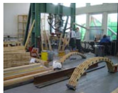
2.1m span test arch

Vertical nailed lamination of timber was developed by Philibert Delorme in 1561. Early vertical lamination was used to make beams to build domes. Modern flat deck stress-lamination was developed in USA during the 1980's. The first stress-laminated timber arch was tested at Napier University in 2002.