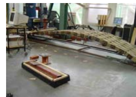
6m span test arch