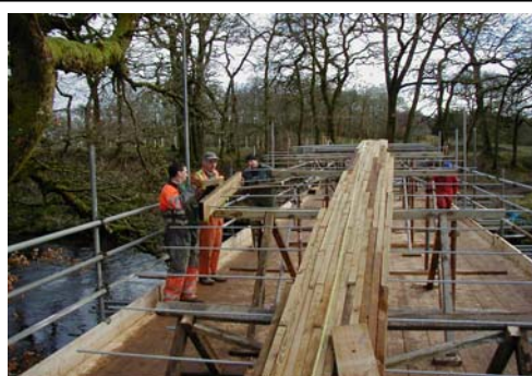
Construction of SLT arch bridge