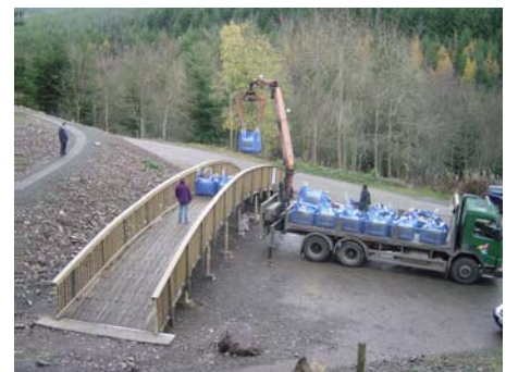
20m Test Span Glentress July 2004