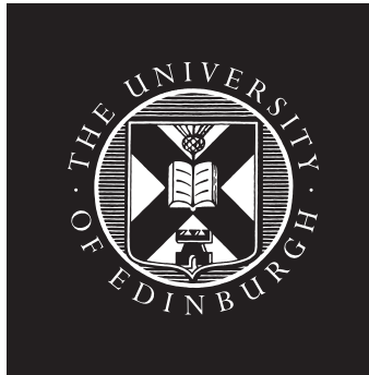
Reverse (white out of background) Do not reverse positive monochrome version