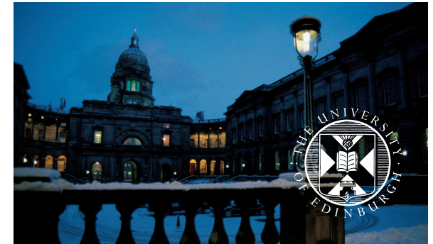
Example of reversed logo appearing on an image

The University logo is used in four sizes, and no other text or images are placed within the surrounding area