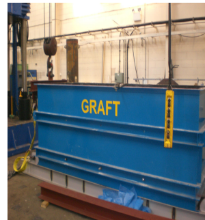
Steel box to hold trackbed

The new cyclic GRAFT (Geopavement & Railway Accelerated Fatigue Testing) facility at Heriot-Watt University consists of a full geopavement or railway trackbed constructed within a steel box 1.06m x 3.0m x 1.15m high. Once prepared the box is lowered into a cyclic hydraulic loading rig that is capable of applying load up to 200 Tonnes.