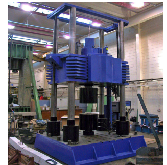
Cyclic loading rig