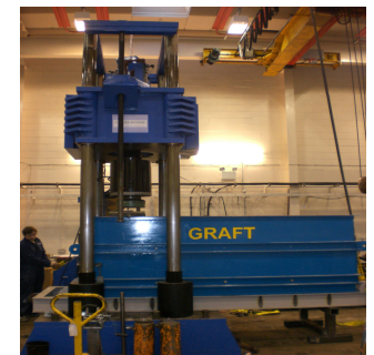
Box positioned under actuator

The centre sleeper is cyclically loaded to 12.5 Tonnes, via the rail section, at a frequency of 4Hz. This loading generates realistic stress levels in the ballast and subgrade layers and simulates a single wheel load of a train travelling over the centre sleeper at 23mph. In total, applying 800,000 cycles (56 hours) is approximately equivalent to one years train traffic on a main line.