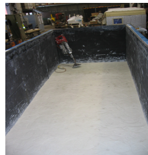
Clay subgrade within tank

The railway trackbed currently under construction within the box consists of a 0.85m deep clay subgrade layer overlain by a 0.3m deep layer of railway ballast. The compacted clay subgrade is shown below. On top of the ballast layer 5 sleeper sections are placed within crib ballast and a rail section is placed on top.